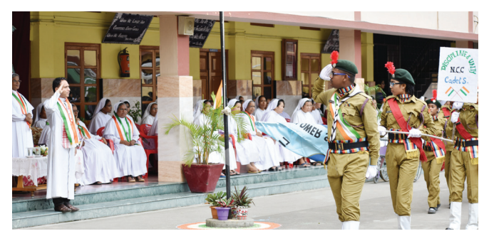
Little Flower, Hatigaon celebrated the 72nd Independence Day with patriotic fervor and respect for the country and its freedom fighters.